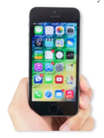
Before the KAMRA inlay